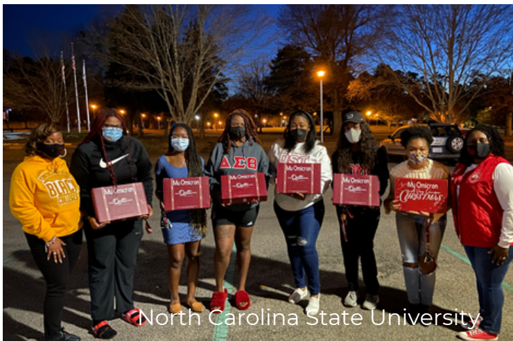
North Carolina State University