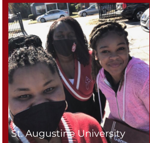
St. Augustine University

The inspirational messages helped to motivate our collegiate Sorors and boost their confidence and provided them with courage and strength needed during a stressful time. We wanted to let our collegiate Sorors know that we were thinking about them during their final exams.