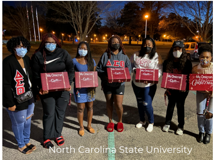
North Carolina State University